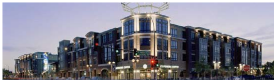
Excelsior & Grand Apartments in St. Louis Park, MN